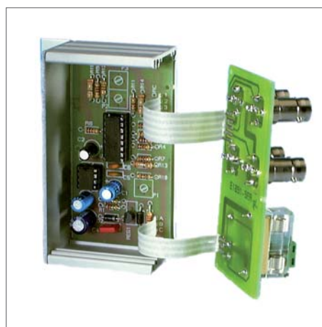
Detail of EVD1M

EVD1/3 1 IN/3 OUT video distributor card (case space: 1 slots). PSM24/2M 230Vac-/24Vac-800mA power supply board (case space: 2 slots). RD10M Rack 19"-2U case for max. 10 slots BP1M Blank panel (space: 1 card)